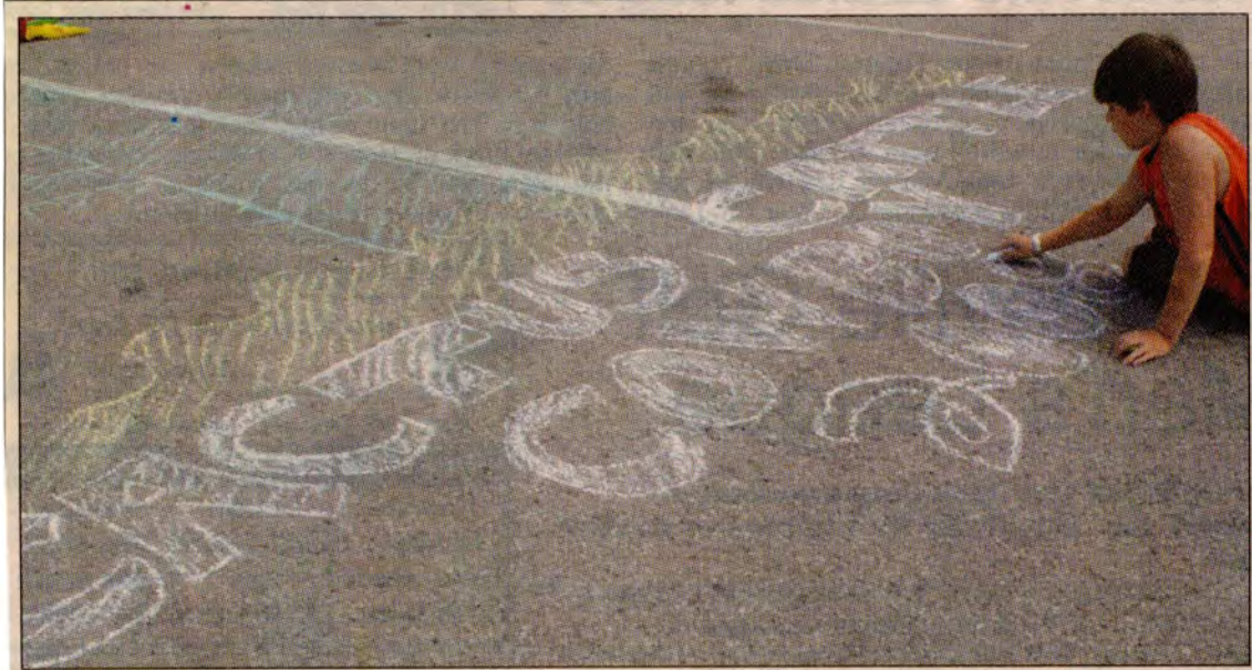
Art on the pavement Jeremy Brand wrote a reminder in chalk of what event was going on in the West Elgin Community Health Centre parking lot August 2. A Farmer's market was set up there to show off top produce from the area.