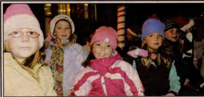
Happy Holidays from Brownies and Sparks! Members of the 1st West Lorne Sparks and Brownies waved to onlookers as their float made its way through West Lorne.