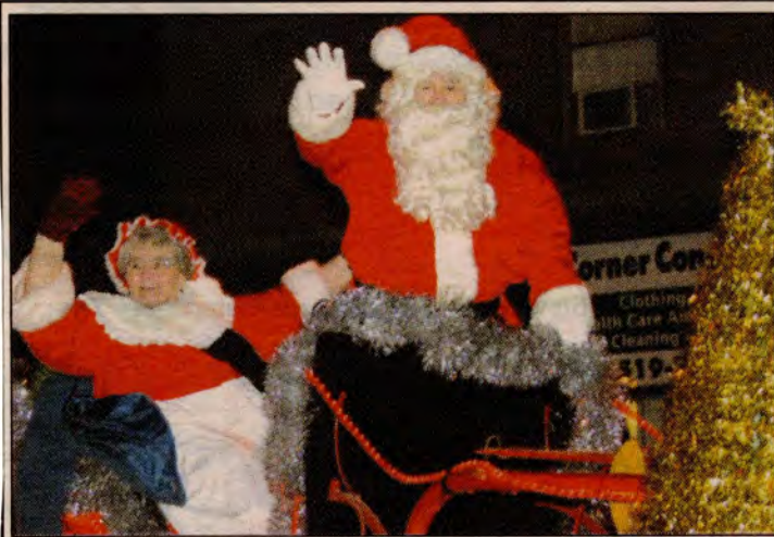
Oh, look! It's Santa! The West Lorne Santa Claus Parade was held Nov. 28. Of course, it wouldn't have been complete without an appearance by Santa.